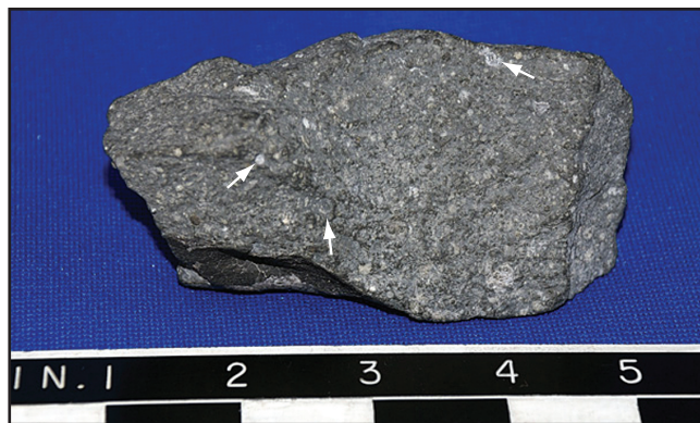
Figure 2—Carbonaceous chondrites, as shown here, range from gray to black and contain large amounts of carbon and organic compounds and also whitish calcium-aluminum-rich chondrules (arrows).

the surfaces of larger asteroids, planets, or moons. The irons and stony irons are thought to have come from the cores or core-mantle boundaries, respectively, of differentiated bodies such as planets and large asteroids that were massive enough to have produced a metallic core, a mantle, and a stony crust during their formation.