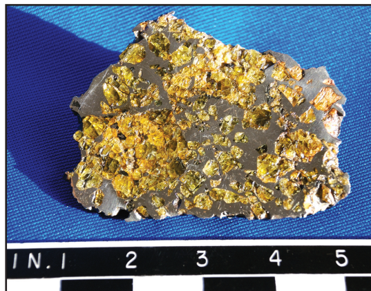
Figure 3—Polished section of a pallasite meteorite, believed to have originated from the core-mantle boundary of a planetary body. Note the greenish-yellow olivine crystals embedded in an iron-nickel alloy.