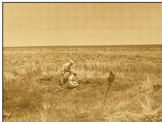
Figure 6—Clyde Fisher, of the American Museum of Natural History, and assistant, inspect the Brenham meteorite "crater." This is one of many Brenham landfall sites scattered over a large area.

of 2005, a specially designed metal detector located the largest piece yet from the Brenham site, a 1,400-pound meteorite. This latest large specimen is an oriented pallasite, a stony-iron body that remained oriented in one position as it fell, rather than tumbling, thus creating a rounded or conical