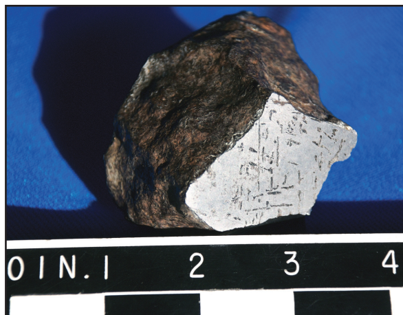
Figure 4—Iron meteorite made entirely of an iron-nickel alloy; note fusion crust and regmaglypts on outer surface. This type is believed to have originated from the core of a planetary body.