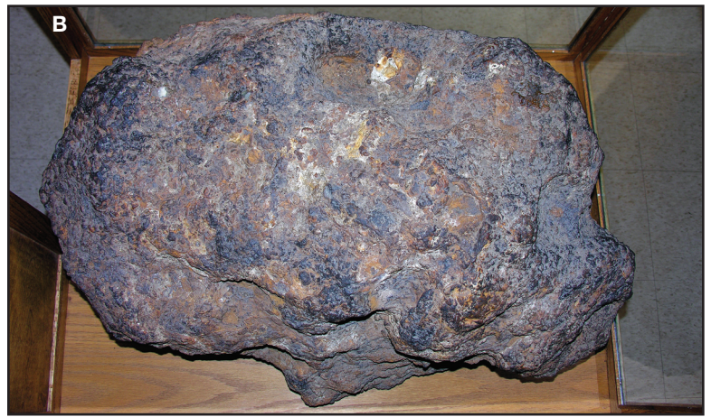
Figure 7—(A, left) Photo of 1,000-pound Brenham meteorite being hoisted from the ground by H. O. Stockwell and others in 1949. (B, above) Stockwell's 1,000-pound Brenham meteorite is on temporary display in the City Building on Main Street, Greensburg, Kansas. Specimen is 21 x 32 inches.

shape on the side that took the brunt of the heat upon entering the atmosphere. Only two larger ones of that type are known to have been found in the world. All of the Brenham specimens are believed to have come from one meteorite that broke up during its fall. Scientists previously estimated that this fall occurred about 20,000 years ago, but recent evidence suggests it fell around 10,000 years ago. Over three tons of Brenham material have been found.