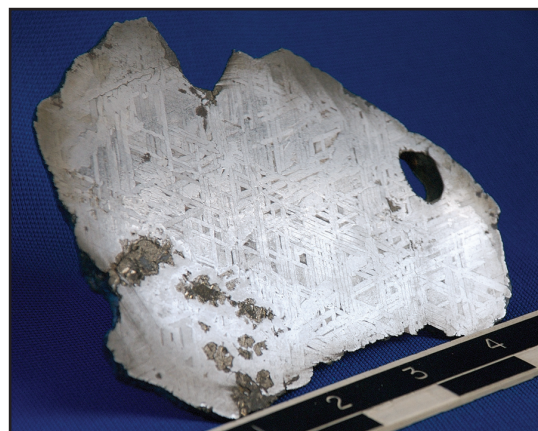
Figure 5—Polished section of an iron-nickel meteorite, showing Widmanstätten pattern.