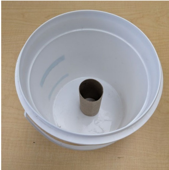
Figure 2: Empty bucket with toilet roll