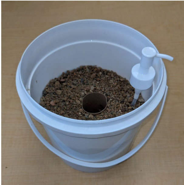
Figure 5 : Soap pump inserted to bucket